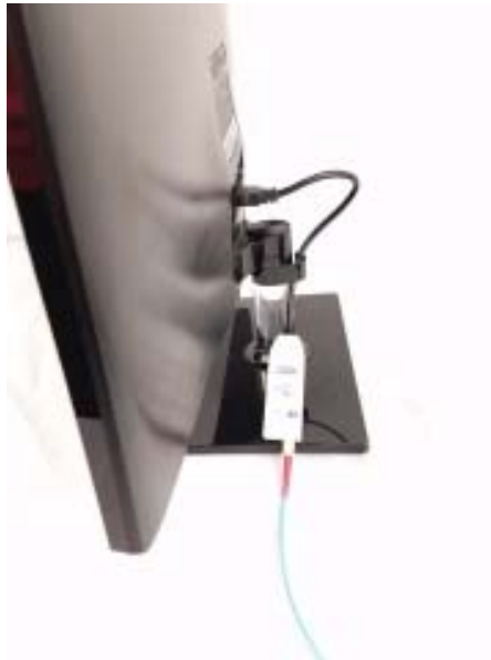
Figure 2-2 Electrical Connection