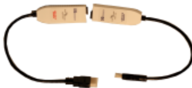
Figure 1-1 LBO-HDMI TX and RX View

Figure 1-1 illustrates the TX and RX view of the LBO-H2 model.